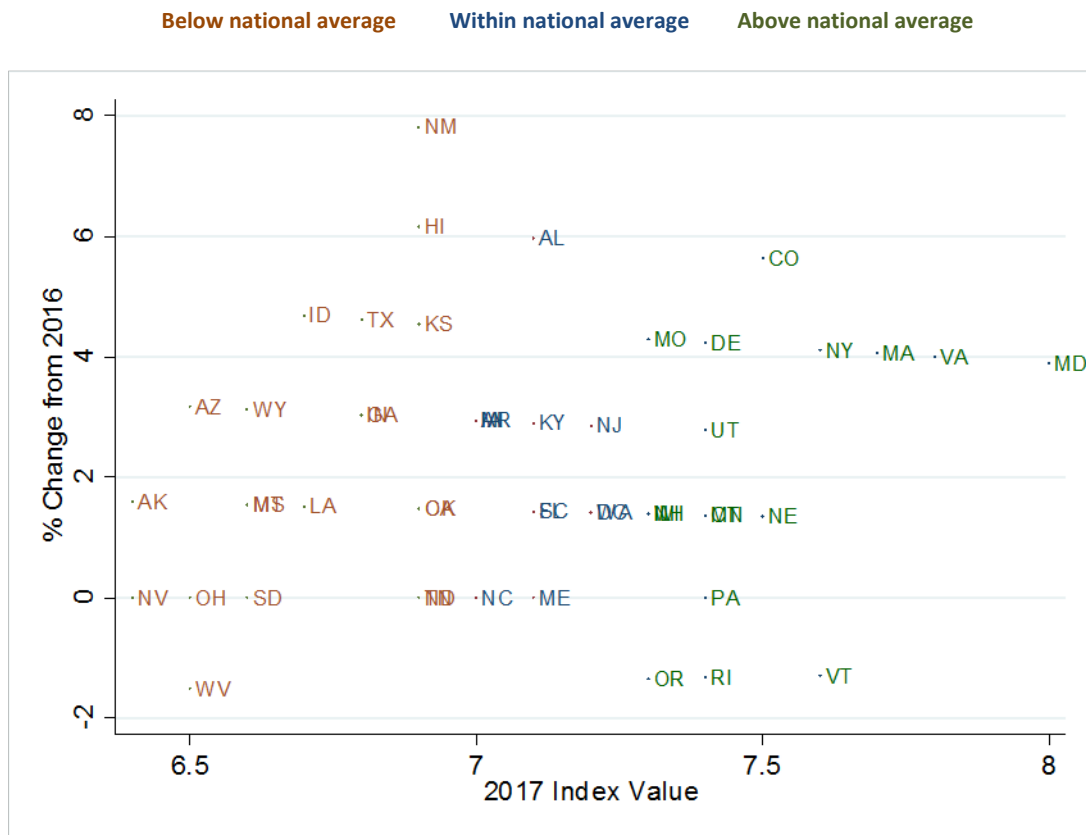
Figure 2. Improvements in health security occurred throughout the U.S., including in states that both lead and trail the national average. However, 12 state failed to gain ground.

The Index is a shared resource for the health security community, and its value will increase as additional knowledge accumulates about both successes and failures in using the Index. Make sure to share your progress and experiences broadly with colleagues and collaborators during meetings, conferences and other convenings. The Index team hosts monthly virtual meetings of the Stakeholder Communications and Engagement Workgroup, where you can provide feedback and ask questions of other Index users. As you encounter ideas for ways of improving the Index measures, methodology, and display features, please make sure to share these thoughts with the Index team.